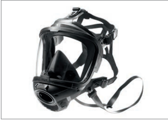
Dräger FPS® 7000, Full-face mask

The full-face masks Dräger X-plore 6300, 6530, 6570 and Dräger FPS® 7000 set innovative safety and comfort standards. These full-face masks provide you with the highest protection level (TM3) based on a reliable tight fit due to a double-sealing frame that fits to individual faces.