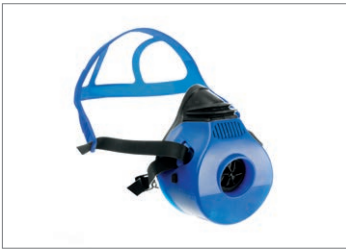
Dräger X-plore® 4740, Silicone

The Dräger X-plore 4700 family is a robust and durable half mask designed to withstand the most demanding conditions. It is also equipped with the proven FlexiFit head harness for easy donning and doffing as well as for comfortable fit. The combination of soft mask body, specially shaped nose seal and a sturdy plastic frame