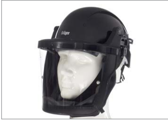
Dräger X-plore® 8000 Helmet with visor