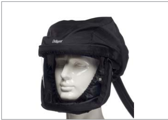
Dräger X-plore® 8000 Protective visor

The Dräger X-plore 8000 helmets with visors and protective visors make even the most challenging industrial job easier by adding eye protection and head protection (helmet with visor only) as an integrated solution of the respirator.